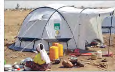
The Rotary Club of Johnstown is raising money for ShelterBoxes, tent systems that can house families left homeless by war or disaster.

According to United Nations officials, more than 2.6 million Ukrainians have fled to neighboring countries, many of them