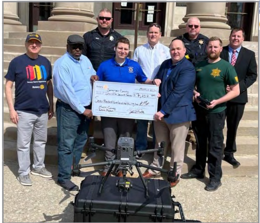
Working together, the Rotary Clubs of Somerset, Conemaugh Township, and Johnstown secured a joint District Grant to assist in the purchase of a new drone for the Somerset County Sheriff's Search and Rescue Team.

Terrain: SAR missions outside human establishments can face challenging terrain in the form of a snowy mountain, rainforest, etc. which might slow the entire operation.